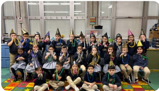
Kindergarten celebrated 2024 with a "Happy Noon Year's" celebration at 12 noon.