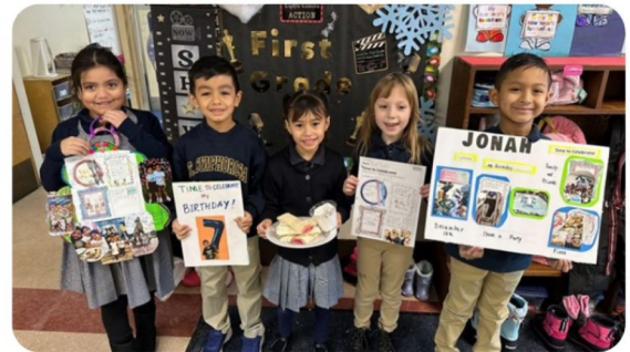
First grade projects sharing all about what traditions and celebrations they love