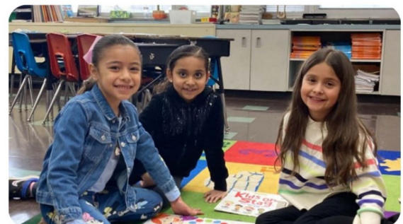
Second grade room 206 at indoor recess

CALL 773.585.6888 OR EMAIL RBANDEN@STSYMPHOROSASCHOOL.ORG TO SCHEDULE A TOUR!