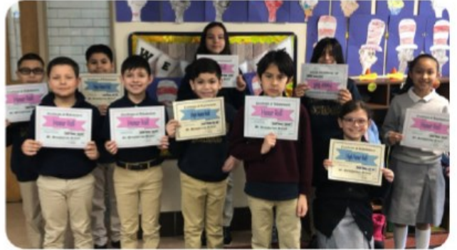
Fourth graders proudly displayed their honor awards for the second trimester.