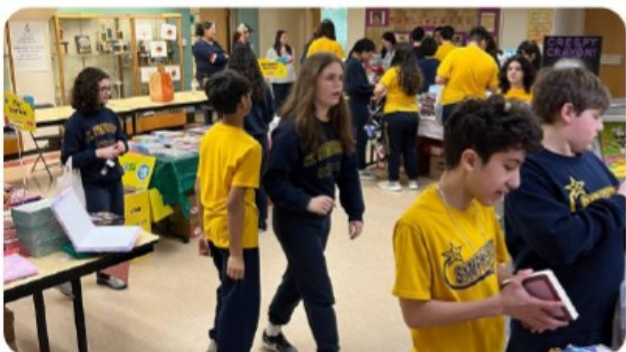
Seventh grade enjoying the book fair.