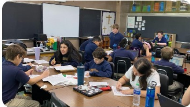
Grade 5 learning about the hydrosphere