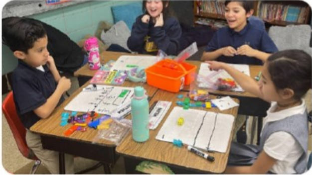
Third graders finding some new ways to have fun with fractions!