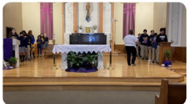
Seventh and Eighth grade preparing for stations of the cross

CALL 773.585.6888 OR EMAIL RBANDEN@STSYMPHOROSASCHOOL.ORG TO SCHEDULE A TOUR!