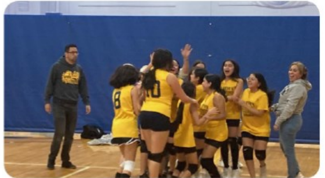
Sixth Grade JV Girls Volleyball Seminal Victory