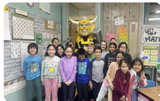
A happily surprised third grade class couldn't wait to pose for the photo-op with this special visitor from St. Lawrence!

CALL 773.585.6888 OR EMAIL RBDEN@STSYMPHOROSASCHOOL.ORG TO SCHEDULE A TOUR!