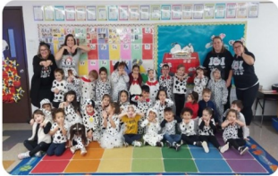
Pre-K celebrating 100 days of school