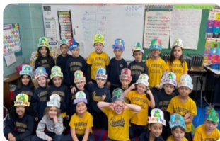
Hopping for joy on Leap Day in First Grade