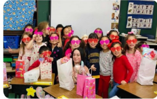
Celebrating Valentine's Day in Kindergarten