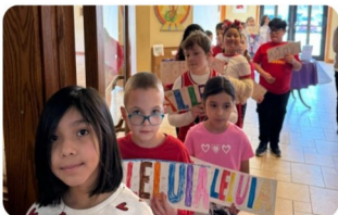
Our second graders have come far and have yet to go a great journey ahead of them this special year.