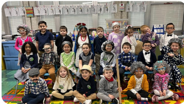
Kindergarten looking a bit older since they started school 100 days ago