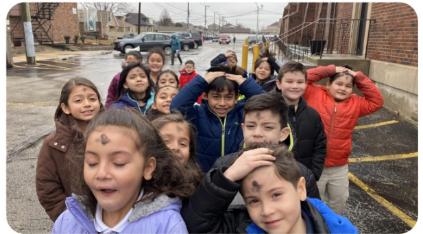
First Graders after Ash Wednesday Mass