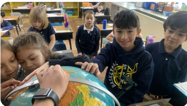
Second grade has been working hard on illustrating themselves on the map by analyzing components like states, continents and cities!