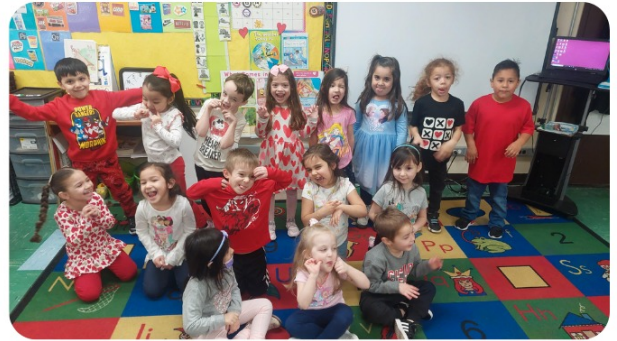
Our Pre-K loves celebrating Valentine's Day!