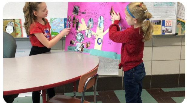
Third graders created a family tree project

STAY TUNED NEXT WEEK FOR HIGHLIGHTS FROM GRADES 4TH-8TH!