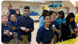
Fifth Grade enjoying the annual Kindergarten lemonade stand