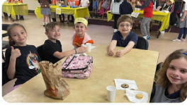
Third graders enjoy some snacks (and company) from the kindergarteners' lemonade stand!