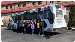
Seventh grade on their field trip to Fair Oaks Farm.