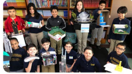
Fourth graders displayed their knowledge of Chicago landmarks.