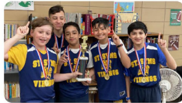
Sixth Grade Boys Celebrate 1st Place JV Basketball Championship