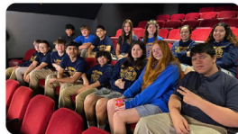
Eighth grade at the Playhouse Theatre

CALL 773.585.6888 OR EMAIL RBDANEN@STSYMPHOROSASCHOOL.ORG TO SCHEDULE A TOUR!