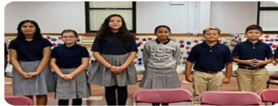
Fifth grade votes in their first student council election