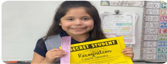
Congratulations to our very first Third grader to earn secret student of the 2023-2024 school year!