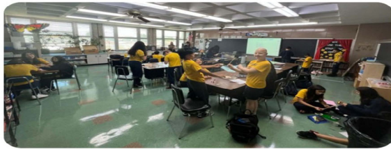
Seventh grade working on a STEM challenge during science class.