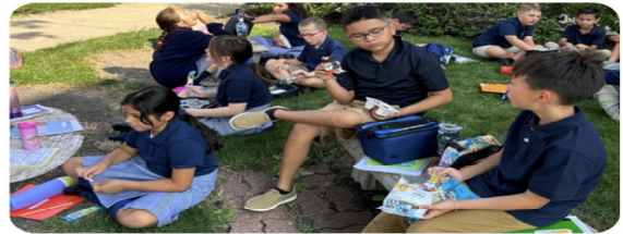
Fourth graders enjoyed the warm weather with a picnic snack