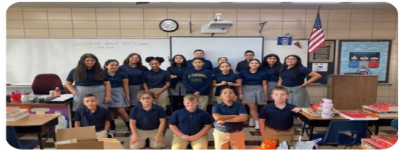
Sixth grade looks forward to a great year!