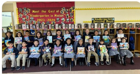
Thank you to "Bernie's Books" for their kind gift of books for the children.