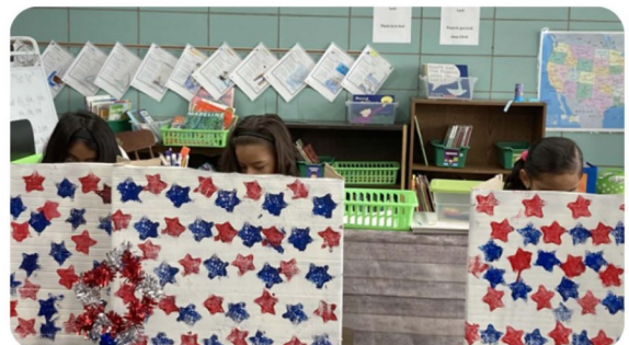
Second grade class room 206 voting.

CALL 773.585.6888 OR EMAIL RBANDEN@STSYMPHOROSASCHOOL.ORG TO SCHEDULE A TOUR! STAY TUNED NEXT WEEK FOR HIGHLIGHTS FROM GRADES 3rd-8th