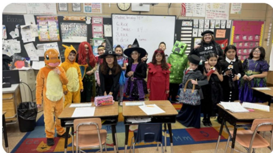
"Here's to more memories in Second grade!"