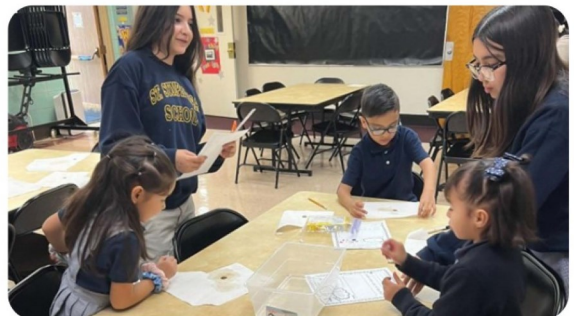
First grade participated in an experiment with the help of their 7th grade buddies.