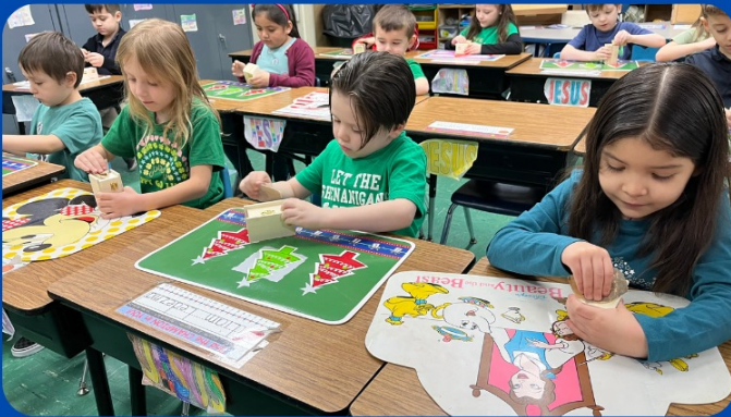
Kindergarten preparing their treasure boxes for the story of Jesus' life, in preparation for Easter.