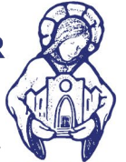
ST. SYMPHOROSA CATHOLIC SCHOOL OF TWO HOLY MARTYRS PARISH