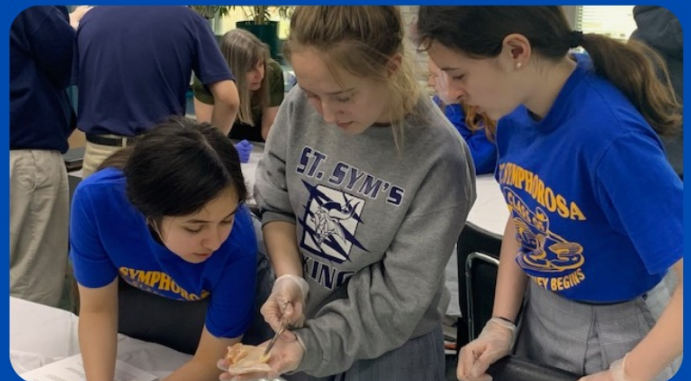
Dissecting chicken wings in science class.

REGISTRATION IS NOW OPEN FOR THE 2023-2024 SCHOOL YEAR!