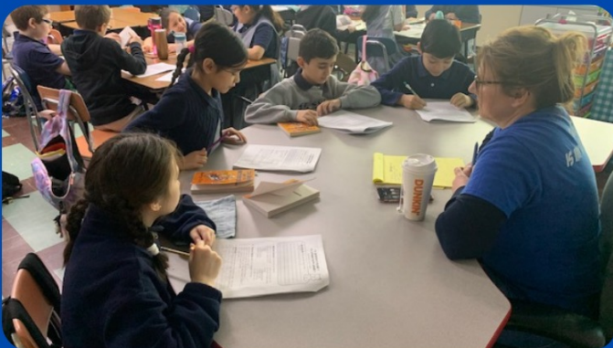
Fourth Grade reading and testing comprehension for "The Mouse and the Motorcycle."