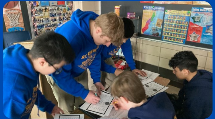
Eighth Graders working on March Madness Brackets of new technology used in WWI