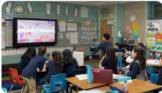
Third grade gets ready for Iready diagnostic #2 with some Kahoot! Fun.