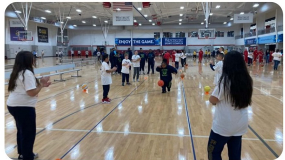
Sixth Grade volunteers at the Special Olympics