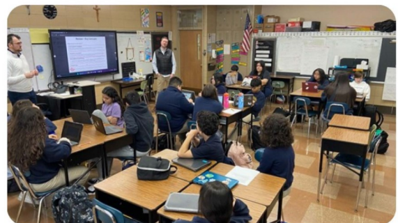
Eighth grade picking their own stocks

CALL 773.585.6888 OR EMAIL RBANDEN@STSYMPHOROSASCHOOL.ORG TO SCHEDULE A TOUR!