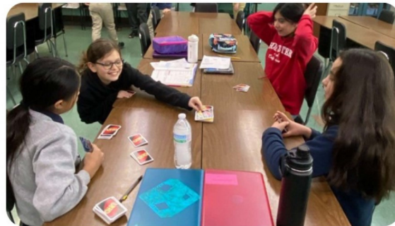
Indoor recess with Uno and Ping Pong Football (a Grade 5 invention)