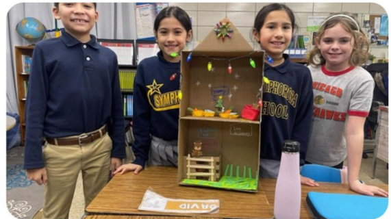
Fourth graders made reindeer barns in Science class as part of a STEM unit.