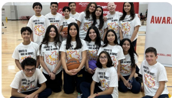
Seventh grade worked as volunteers for the Special Olympics