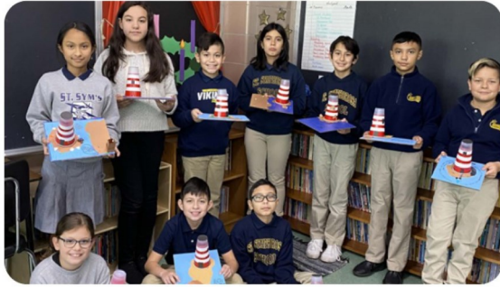
Lighthouse project for Grade 5 Family Mass