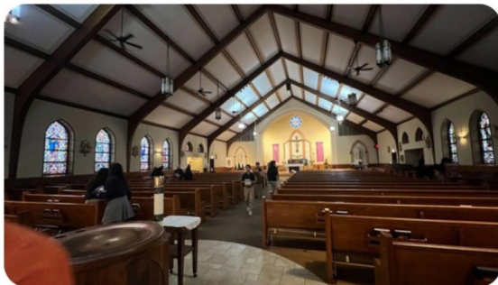
Seventh graders helped to restock the new missalettes for church