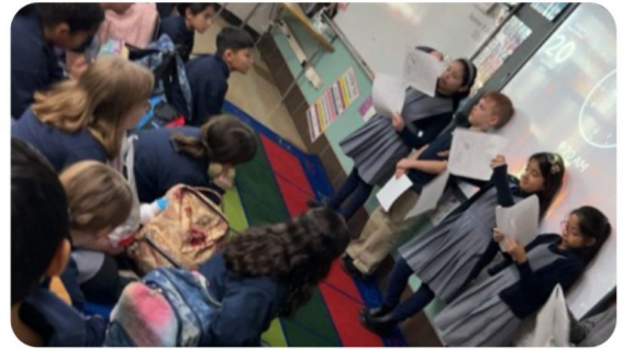
Third and fourth graders performed Readers Theater plays to each other.