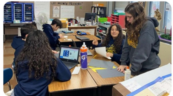
Eighth grade crafting for the door decorating contest

CALL 773.585.6888 OR EMAIL RBANDEN@STSYMPHOROSASCHOOL.ORG TO SCHEDULE A TOUR! MARK YOUR CALENDARS! CATHOLIC SCHOOLS WEEK OPEN HOUSE Sunday, January 28, 2024 10:30am-1:30pm