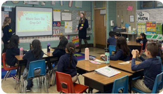
Third grade gets the “dirt” on some of our local Illinois farms, thanks to Agriculture In The Classroom!