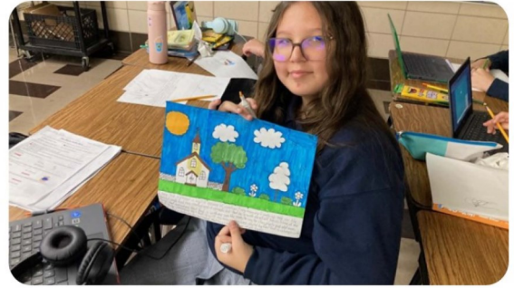
Sixth Grade Working On Their AOC Religion Project