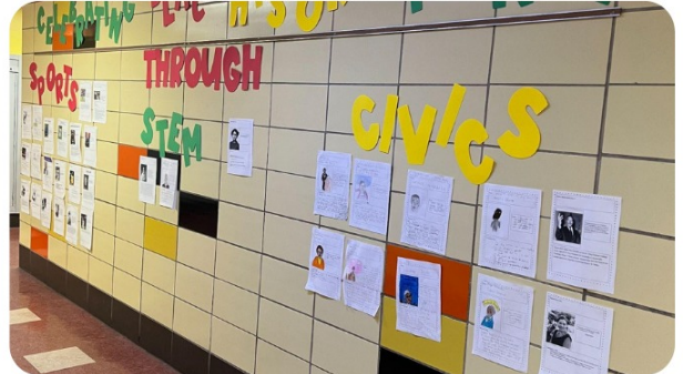
The students worked on celebrating Black History Month by highlighting some of the important figures in African American history.