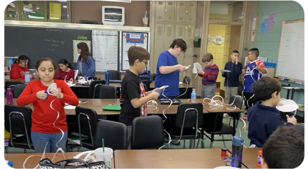
Fifth grade in the STEM paper plate challenge