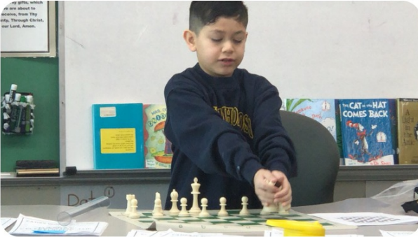
Fourth graders taught us “How-To” do a variety of tasks, like playing chess.