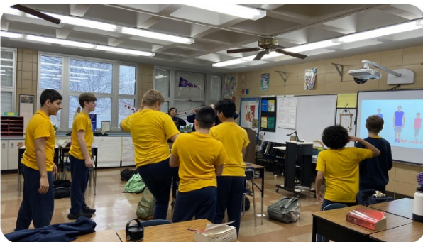
Eighth Grade indoor gym class!