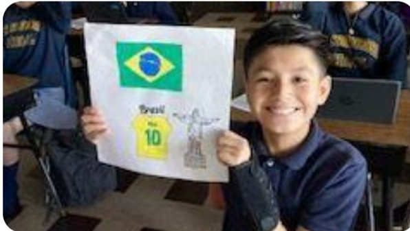
Sixth Grade country projects!