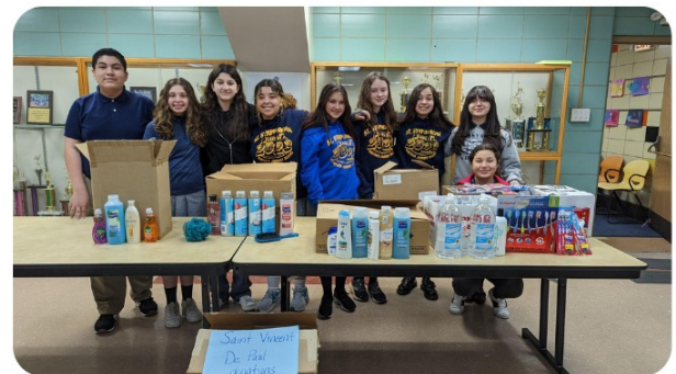
Student Council packed up all our donations that our school collected for St. Vincent DePaul