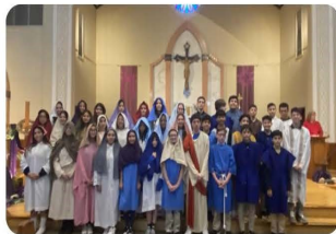
Seventh and Eighth Grade take us through the Living Stations of the Cross

CALL 773.585.6888 OR EMAIL RBDEN@STSYMPHOROSASCHOOL.ORG TO SCHEDULE A TOUR!