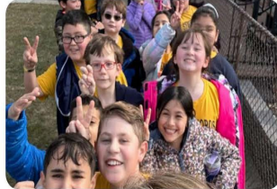
Fourth Grade enjoyed the warmer weather with a neighborhood walk.