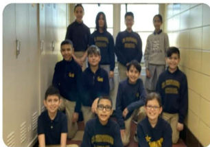
Fifth Grade smiles!