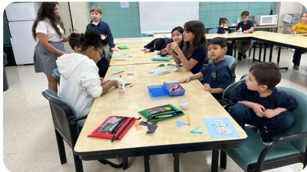
Kindergarten and their Fifth Grade buddies making snowmen out of shredded paper