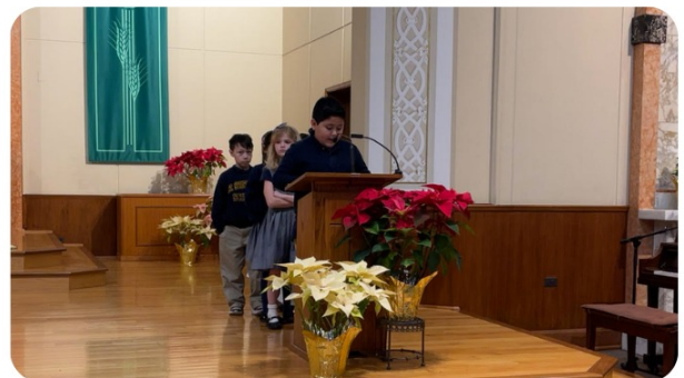
Third grade hosting Mass.

STAY TUNED NEXT WEEK FOR HIGHLIGHTS FROM GRADES 4TH-8TH!