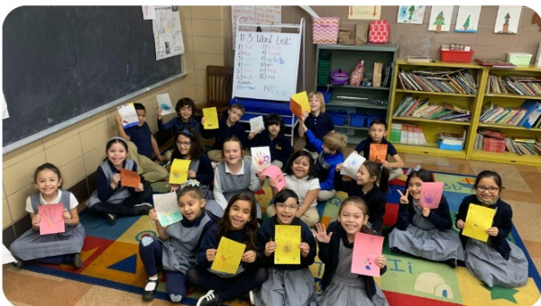
Second grade learning about The Liturgy of the Eucharist as they are coming closer to receiving communion!