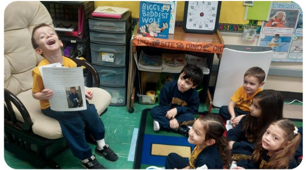
A snapshot of a Pre-K friend sharing his adventures with Pete the Cat