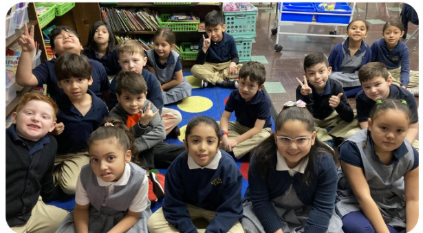
First Grade's morning meeting