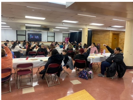
This is a Photo from the Jan. 27 th Communion Bread Meeting ... Another Toast To Jesus !!! Cheers !!!

Our level eight students, preparing for Confirmation have been assigned their "Saint Projects" (a requirement for Confirmation.) The students will select their saints to research, and they will present their findings to their class in the coming months. Many times, our Confirmandi choose the saint whose name they take as their Confirmation name. Please visit the Display in the Narthex.