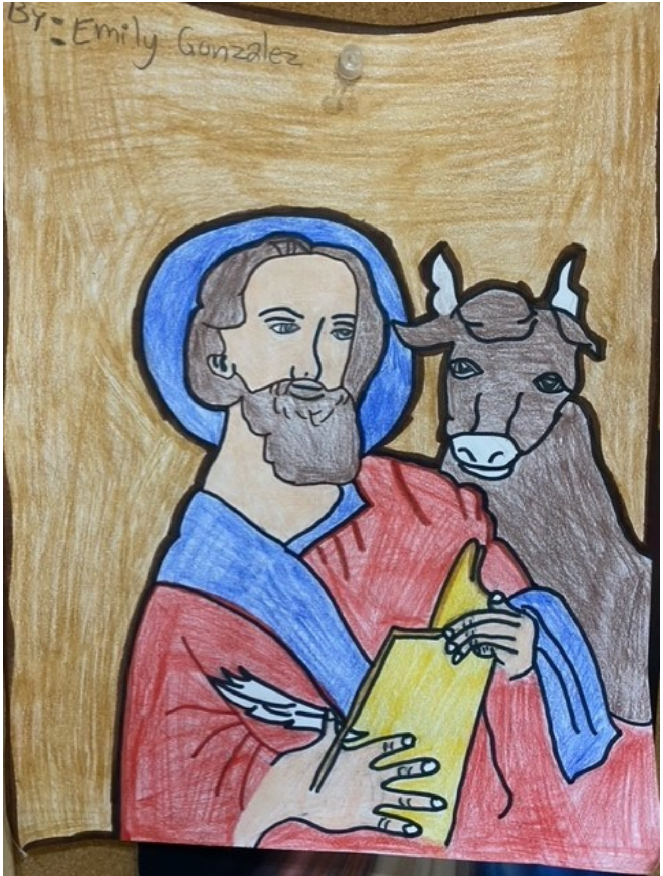
Drawn by 2024 Confirmation Candidate