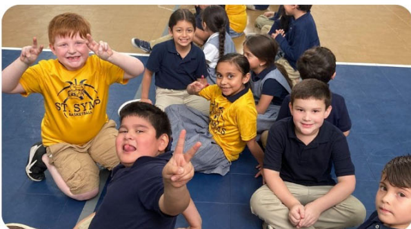
First grade room 206 at a Friday assembly