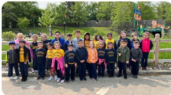
The Kindergarten class adopted "Bunny," the Reindeer, at Brookfield Zoo, with the proceeds from their lemonade stand