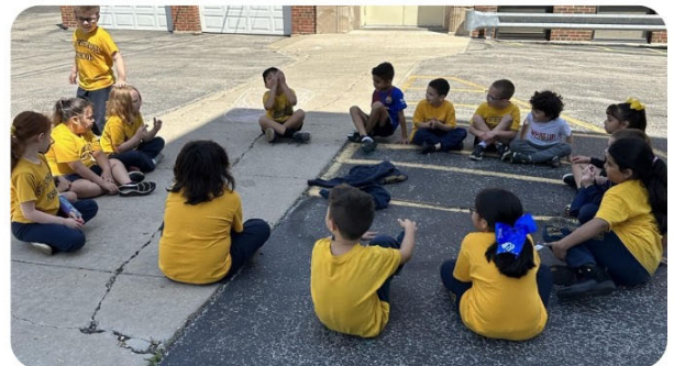
First grade room 105 enjoying spring by playing a fun game of duck duck goose!