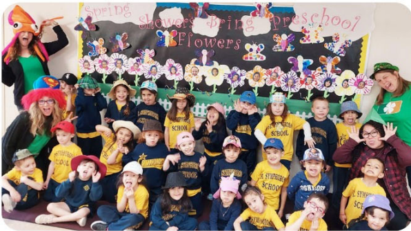
All of Pre-K enjoyed the letter H for Hat day during our ABC countdown!