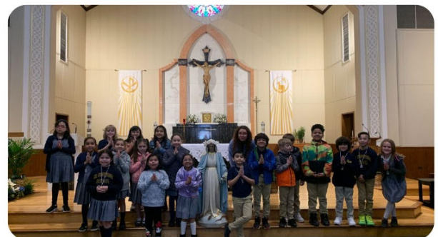
Second grade, you will be missed. We have shared a long sweet journey together this year.

CALL 773.585.6888 OR EMAIL RBANDEN@STSYMPHOROSASCHOOL.ORG TO SCHEDULE A TOUR! STAY TUNED NEXT WEEK FOR HIGHLIGHTS FROM GRADES 3rd-8th